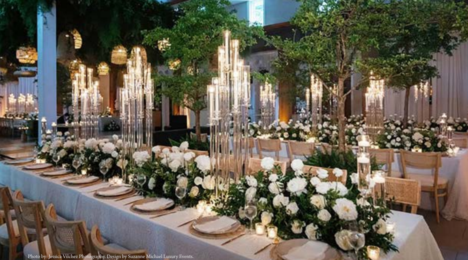
Design by Suzanne Michael Luxury Events.