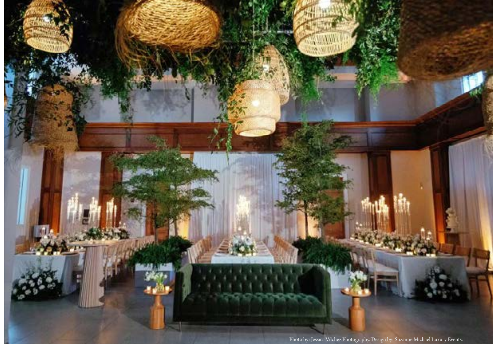
Design by: Suzanne Michael Luxury Events.

Fairchild is a non-profit organization, and one of the premier conservation and education-based gardens in the world. We lead the way in student-led botany programs and STEM initiatives.