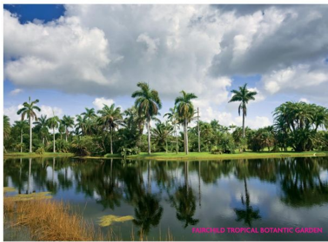
FAIRCHILD TROPICAL BOTANTIC GARDEN

What else would you use that great, green swath of commons for?