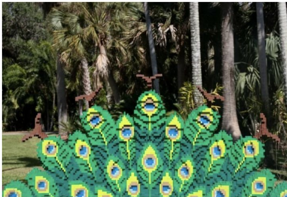
Facebook Fairchild Tropical Botanical Garden

Picture over 700,000 Lego bricks formed into sculptures throughout the garden. This one-of-a-kind experience is not to be missed.