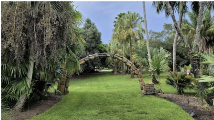
Google Jam Maas

The Nature Connects exhibit will run through August 28th, 2022, and is showcased daily from 10 a.m. to 5 p.m.