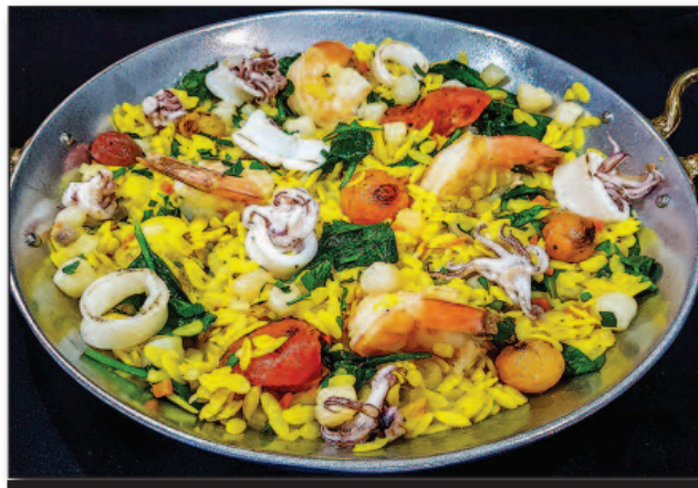
A FISH CALLED AVALON ON OCEAN DRIVE NOW OFFERING TAKE OUT – ORZO SEAFOOD PABELLA

With 270 restaurants listed and counting, Miami Eats by the GMCVB offers endless opportunities to enjoy breakfast, lunch, dinner, and even wine, beer and cocktails, from our destination's favorite restaurants. Some restaurants are new to dining out and some are offering affordable family meals, gourmet make-at-home meal