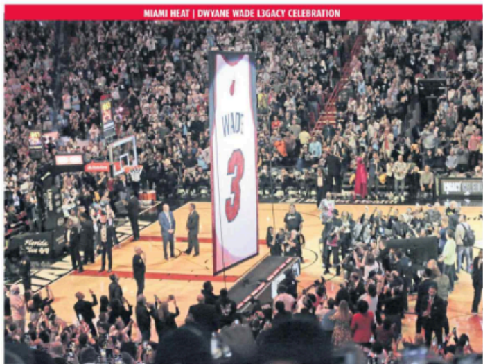
MIAMI HEAT | DWYANE WADE LGACY CELEBRATION

We examine women's heart health, cardio risks of Hispanics and blacks, the benefits of a vegan diet, children's cardiac issues and more. 1UH