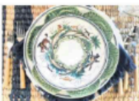
HOME HOW TO SET A SPRING TABLE, 7