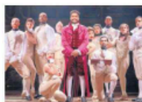
ARTS ARSHT'S 'HAMILTON' OUTDOES ITSELF, 10