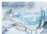
TRAVEL WHAT'S NEW AT THE THEME PARKS, 11