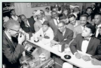
Malcolm X trains his camera on Cassius Clay, sitting at the counter of Miami's Hampton House in 1966, surrounded by fans after he lost Sonny Liston for the heavyweight championship of the world title on Feb. 25, 1964, in Miami Beach. The next day, Clay announced he had become a member of the Nation of Islam and changed his name to Muhammad Ali.

We still have entertainment and cultural venues like the restored Lyric Theater in Overton. Schools named for notable African