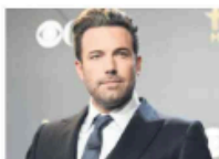
PEOPLE BEN AFFLECK SHOWS OFF HIS SPANISH, 5

JOBS AND CLASSIFIEDS: INSIDE THE NEXT SECTION